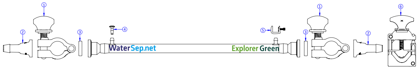
Diagram: Flow Connector Kit- Explorer ™ without sensors

FlowConnector ™ Kits - Explorer ™ connect your WaterSep Explorer ™ cartridge to your tubing and pump. The kits come with or without PendoTECH pressure sensors that enable monitoring of transmembrane pressure (TMP).